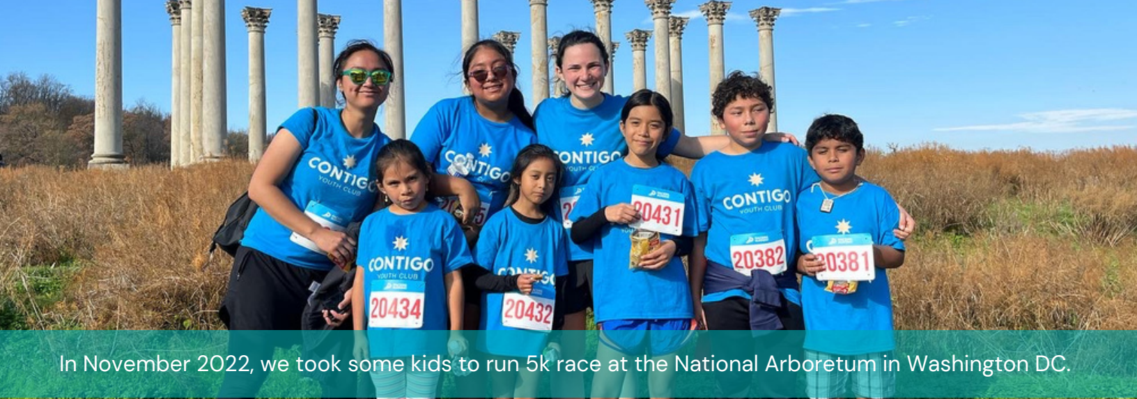
In November 2022, we took some kids to run 5k race at the National Arboretum in Washington DC.